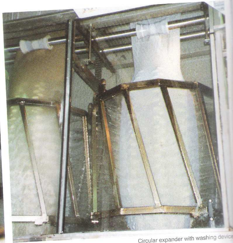
Circular expander with washing device